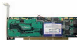
3ware 9500S-4LP with BBU