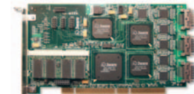
3ware 9500S-12MI with Multi-lane cable